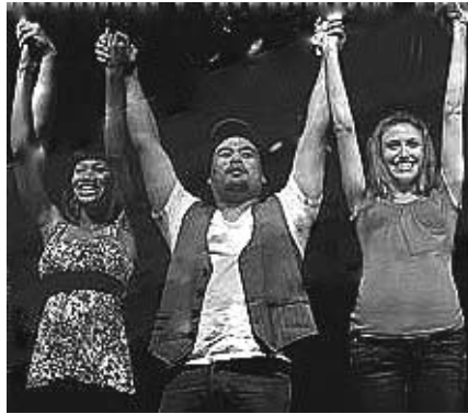
An enlightening musical will be performed by StandUP! at the second general session on Nov. 19.