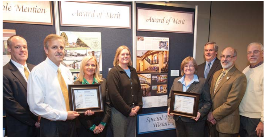
The annual Exhibition of Educational Environments bestows awards at the Joint Annual Conference for top school designs. Winners receive plaques, like this group did at the 2012 conference.

Plans call for preliminary materials to be submitted by Sep. 9 and