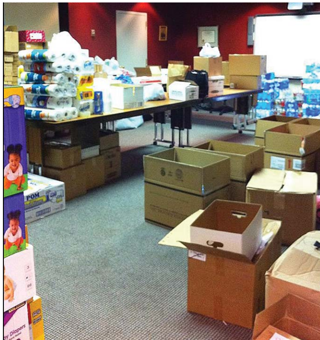
Donations have already begun to come in at the Oklahoma State School Boards Association for much-needed tornado relief.

They are also accepting supplies for families that have been displaced. These include canned goods, formula, diapers, baby wipes, soap,