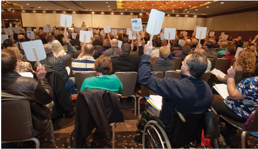
School board representatives from more than 300 school districts cast votes last year on resolutions at IASB's Delegate Assembly at the Joint Annual Conference in Chicago.