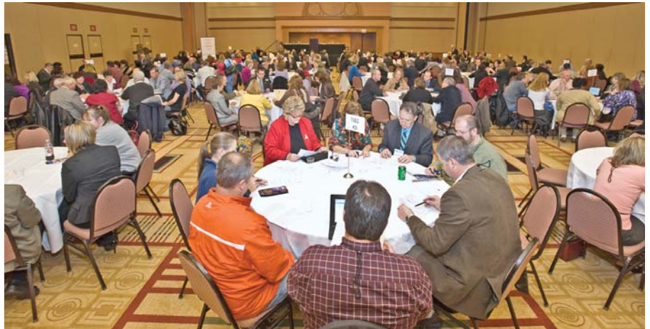
The annual Carousel of Panels at the Joint Annual Conference offers a wide assortment of panel discussions in large adjoining rooms. This year it is anticipated that 36 different presentations will be offered at one time. Visitors can participate in three different panels lasting 30 minutes each.

Members; Plainfield C.C. District 202 Performance Evaluation Reform Act (PERA) & School District Responses; Eastern Illinois University, Charleston