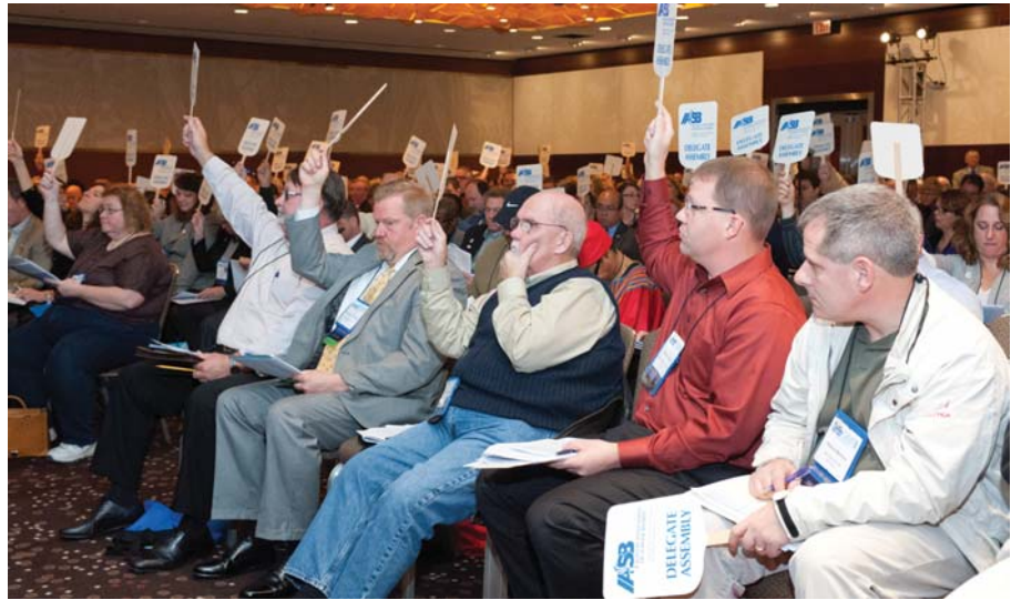
IASB's Delegate Assembly is held each year at the Joint Annual Conference. School board delegates this time will vote on 20 new resolutions on Nov. 23 in Chicago.

Geneseo CUSD 228 – Support legislation that causes all statutory and regulatory educational mandates to