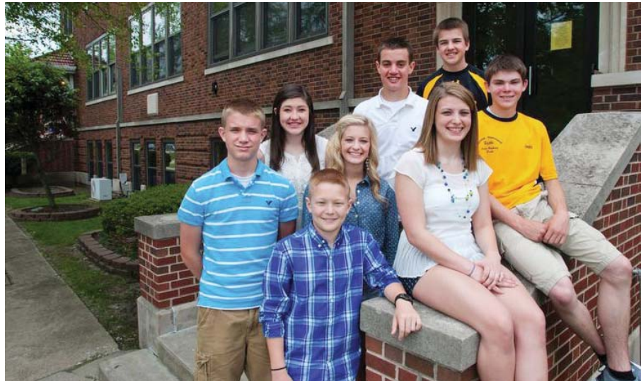
Students who will be juniors and seniors when Arthur-Lovington and Atwood-Hammond merge next year sit outside Arthur-Lovington High School. The four students on the left are all from Arthur-Lovington, and three of the four on the right are from Atwood-Hammond.

According to figures provided by the Illinois State Board of Education, the state will provide about $242,000 of "reorganization incentives" to the Arthur school district during the con-