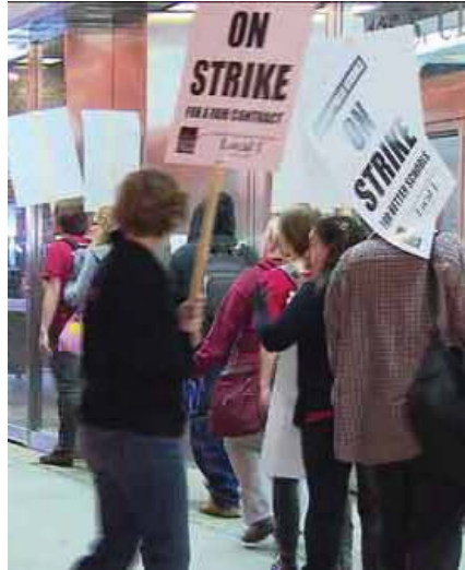
The eight-day strike in Chicago District 299 idled more than 26,000 teachers and kept more than 350,000 students out of class. It was the first strike in the city in 25 years.

Although the union reportedly sought assurances that laid-off but qualified teachers would get dibs on jobs anywhere in the district, Illinois