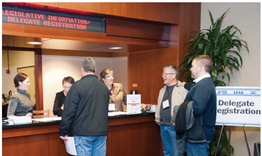
The IASB Delegate Assembly registration desk at the Joint Annual Conference is always a hub of activity as representatives of local school boards register in advance of voting on officers and resolutions to lead their association.

Instructions and sample news releases are available on the IASB Members-Only website at: http://members.iasb.com .