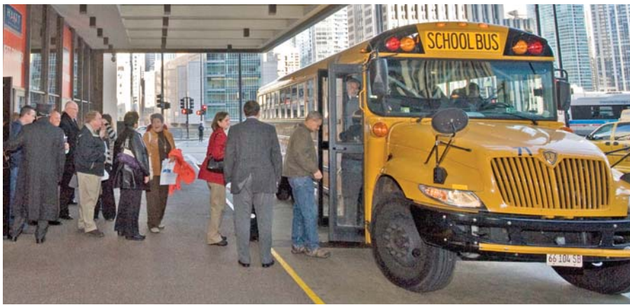
Chicago Schools Tour participants can hop aboard their tour bus after a buffet-style breakfast at the West Tower of the Hyatt on Friday, Nov. 16.