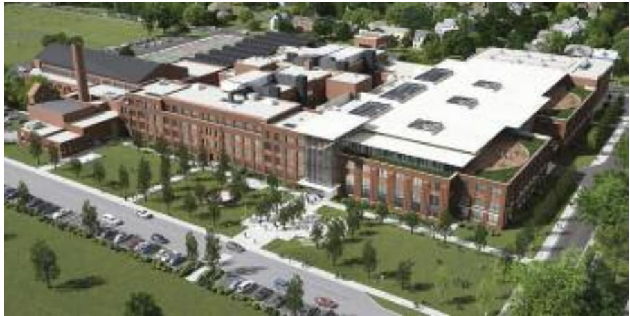
One proposal seeks voter approval for an $89 million bond issue to renovate the Winnetka campus in New Trier THSD 203 , as envisioned in this architect's drawing.