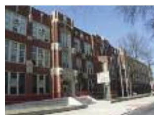
Christian Fenger High School