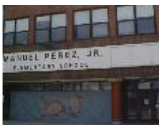
Manuel Perez Elementary School

Back of the Yards College Preparatory High School (new wall-to-wall IB high school, grades 9-12): Want to visit a new state-of-the-art high school that integrates international-mind-