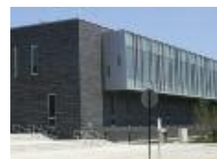
Sarah E. Goode STEM Academy

edness and global perspectives? Innovative curriculum and modern design are showcased throughout this new high school. The school offers the International Baccalaureate (IB) curriculum wall-to-wall, creating the opportunity for every student to access IB through a flexible framework that promotes intercultural respect and understanding. Website: www.boycp.org .