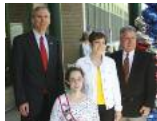
Blair Early Childhood Center