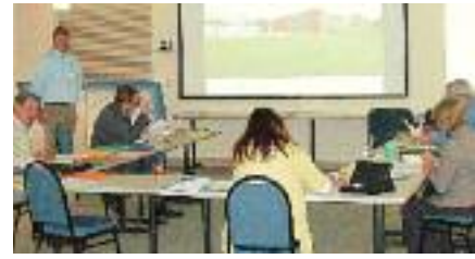
A jury of architects and superintendents chose the top school designs on Sep. 18 at IASB headquarters in Springfield.

Criteria for award submissions included: program/challenge met, how the facility meets 21st century edu-