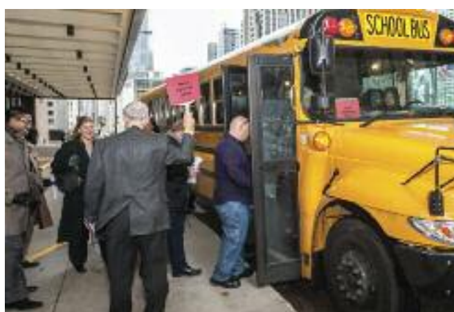
Like last year, the buses will board participants for the Chicago Schools Tour on Friday morning.