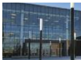
Back of the Yards High School