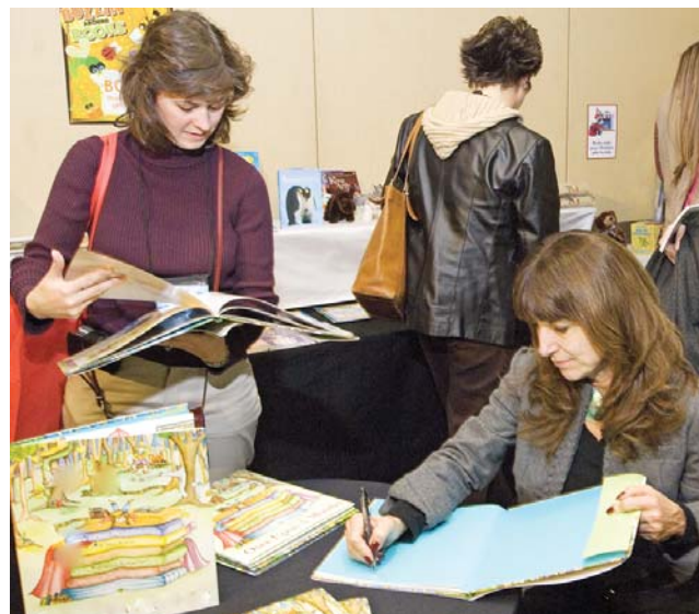
Getting a ‘presentation copy’ of a good book signed as a Christmas gift is easy for attendees at the Joint Annual Conference.