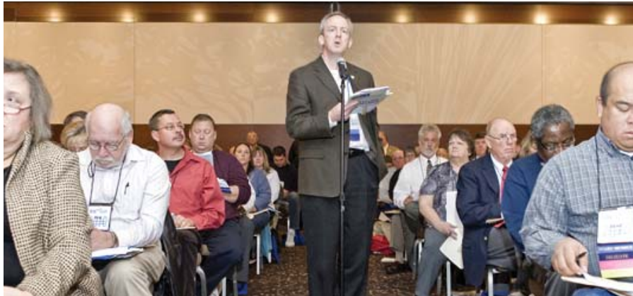
Resolutions put forward by IASB member school boards were debated and voted upon in order to establish policy for the association at the 2010 Delegate Assembly.