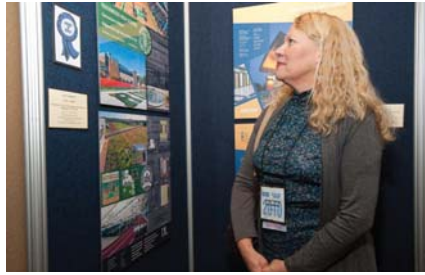
School design professionals show their best work at the Joint Annual Conference. The top designs will be on display in Columbus Hall this year.

Criteria include suitability for stated program requirements, functional relationships, aesthetics, grade level or departmental organization, flexibility, expansibility, compatibility with external environment, uses of new technology, barrier-free accessibility, energy efficiency, environmental controls, site adaptation, vehicular and pedestrian circulation,