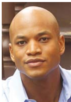
Acclaimed author Wes Moore, an Army officer, Rhodes Scholar, White House fellow, youth advocate and business leader, will sign books in the Conference bookstore on Nov. 18 after keynoting the first general session.