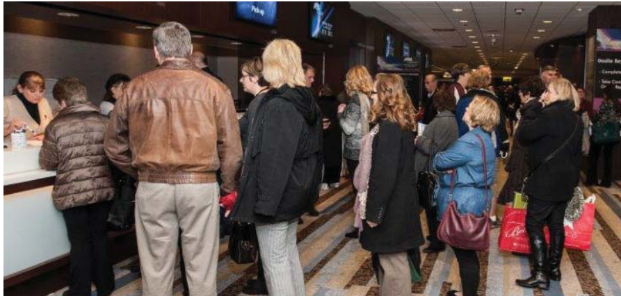
Conference attendance rose 2.5 percent from last year in the Centennial-year gathering Nov. 22-24 in Chicago.