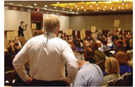
School board delegates from across the state voted on key proposals to set direction for IASB in the coming year. More than 390 delegates participated.

Representatives also approved a resolution seeking to regulate state-authorized “virtual” charter schools. The aim is to ensure that such schools, which would allow students to attend school entirely online, meet the full needs of Illinois students and follow the intent of the current state laws. Currently, virtual schools could draw the same amount of public funds from local school districts as if they were brick and mortar schools, taking the equivalent of 75 to 125 percent of the