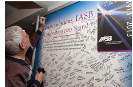
The IASB Information Room reflected an anniversary atmosphere with a mural and greeting cards.

On Friday, Saturday and Sunday, the IASB bookstore offered a variety of Centennial commemorative