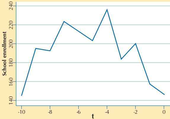
School enrollment — Graph 3