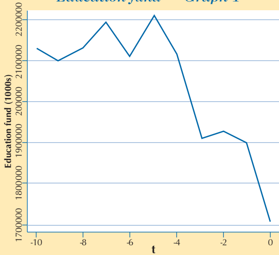
Education fund — Graph 1